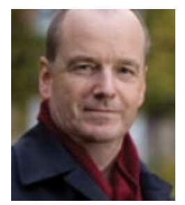
The time is right to confront misconduct