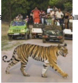
Seven days: 27 July–2 August 2012