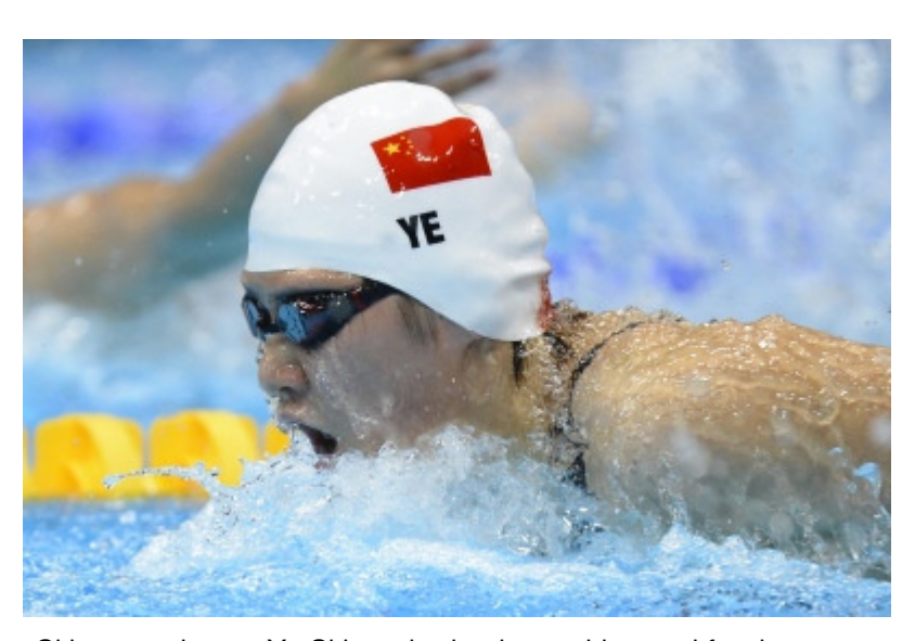
Chinese swimmer Ye Shiwen broke the world record for the women's 400-metre individual medley event at the Olympic Games on 28 July.

At the Olympics, how fast is too fast? That question has dogged Chinese swimmer Ye Shiwen after the 16-year-old shattered the world record in the women's 400-metre individual medley (400 IM) on Saturday. In the wake of that race, some swimming experts wondered whether Ye's win was aided by performance-enhancing drugs. She has never tested positive for a banned substance and the International Olympic Committee on Tuesday declared that her post-race test was clean. The resulting debate has been tinged with racial and political undertones, but little science. Nature examines whether and how an athlete's performance history and the limits of human physiology could be used to catch dopers.