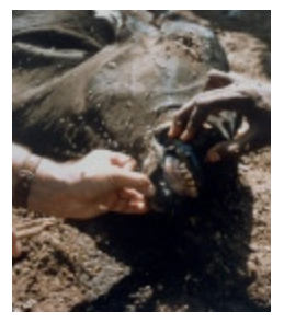
Officials act to secure cattle-plague virus